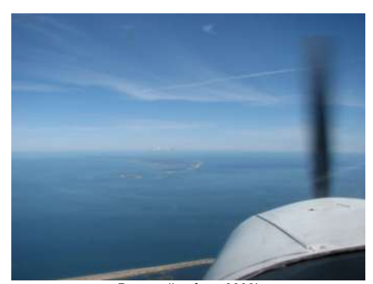
Descending from 3000'

All in all it turned out to be a great time on the Grey Lady!