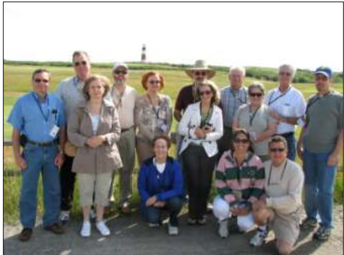
In S'conset near the Sankaty Lighthouse