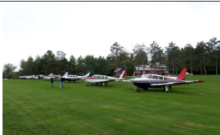
Basin Harbor, VT