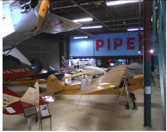
Lock Haven, PA