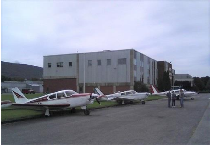
Lock Haven, PA