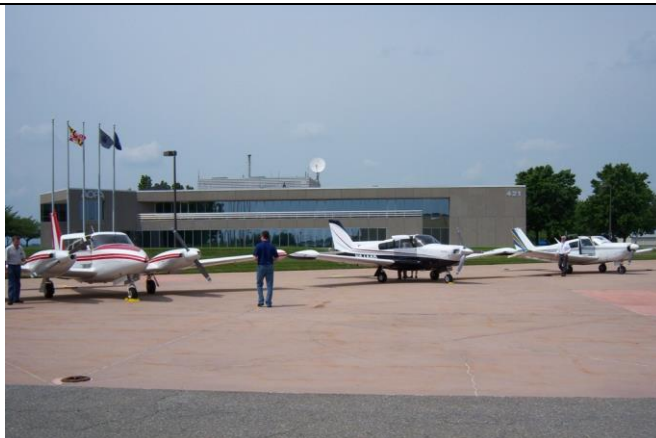
AOPA Frederick, MD