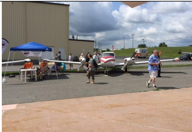
AOPA Frederick, MD