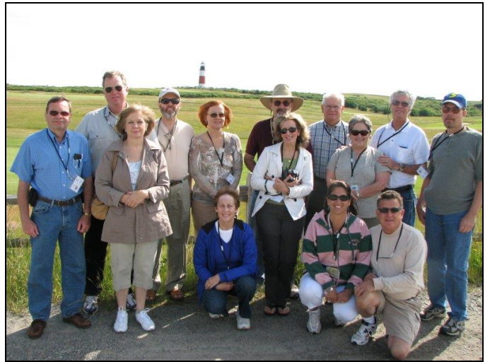
The group near the Sankaty Lighthouse