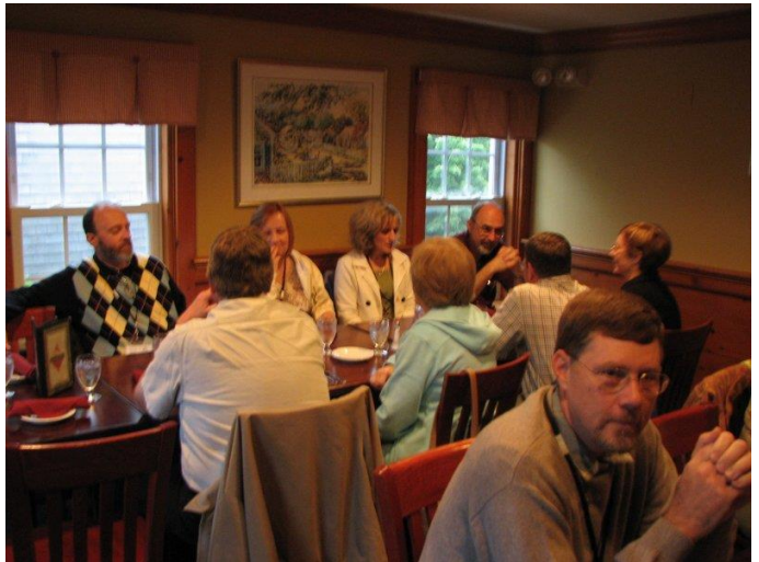
Dinner at AK Diamond's