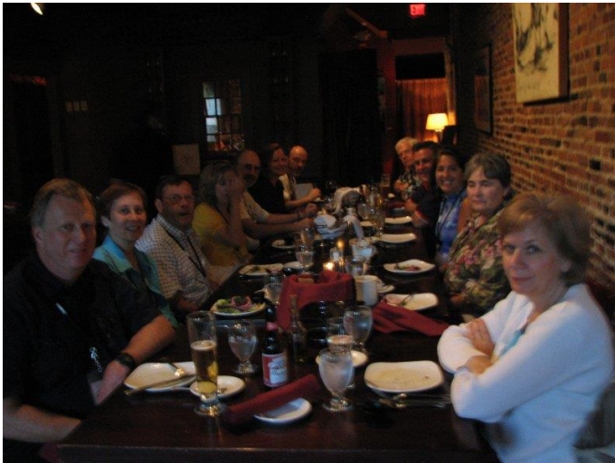
Dinner upstairs at Arno's