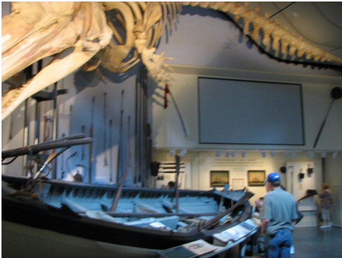
Nantucket Whale Museum