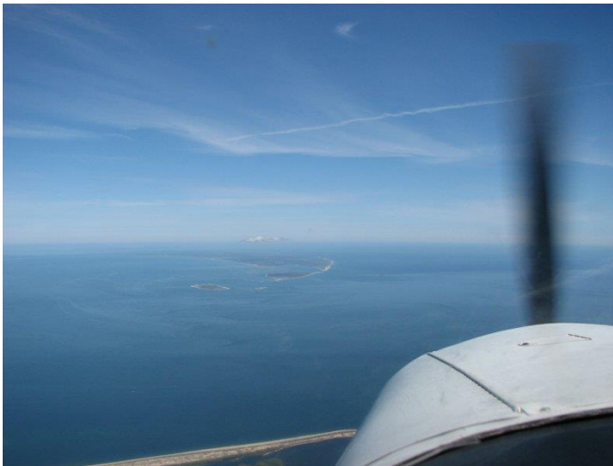
Descending from 3000'