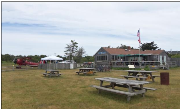
Right Fork Diner

Katama Airpark is a grass strip airport on the southeast corner of Martha's Vineyard, just to the east of the KMVY Class D airspace. There is parking near the FBO office and Right Fork Diner at the north end of Runway 3-21, and a taxiway to the beach parking at the south end. From there it is only a few steps the one of the finest beaches on the island, with sparkling sands and Atlantic Ocean surf. Bring your families, your beach toys, and (for the brave) your swimsuits!